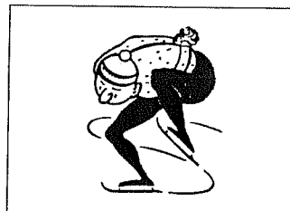
Wow! My own skates!

As previously mentioned in this newsletter our club rental skates are for the purpose of introducing skaters to the sport of short track speedskating. They have center mounted blades that are not bent and are made to accommodate a great variety of foot sizes and shapes. Therefore they do not fit as snugly as a boot should. So, when is it time to purchase your own equipment? 1) When a skaters speed and skating ability surpass the equipments design or 2) when a skater determines that this is the sport for them and want equipment of their own. Either way make sure to talk to one of the coaches before making a purchase. Often there is quality used equipment available at a very reasonable price. If you have questions please ask. We would love to help!