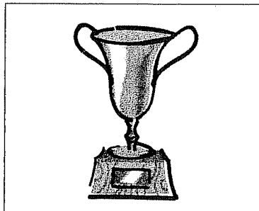
Our National Team did us all proud!